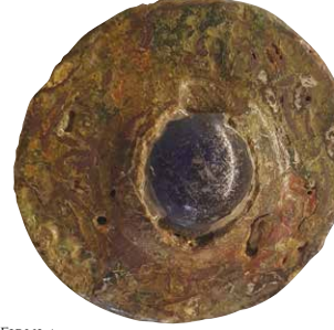
FIBULA BRONZE AND GLASS PASTE TIE USED TO FIX TOGETHER THE ENDS OF A CLOTHING

In order to enhance the archeological site and to present the different collections found during excavations, the local council community of the 4 valleys (CC4V) holds the project of the future Segeta Museum.